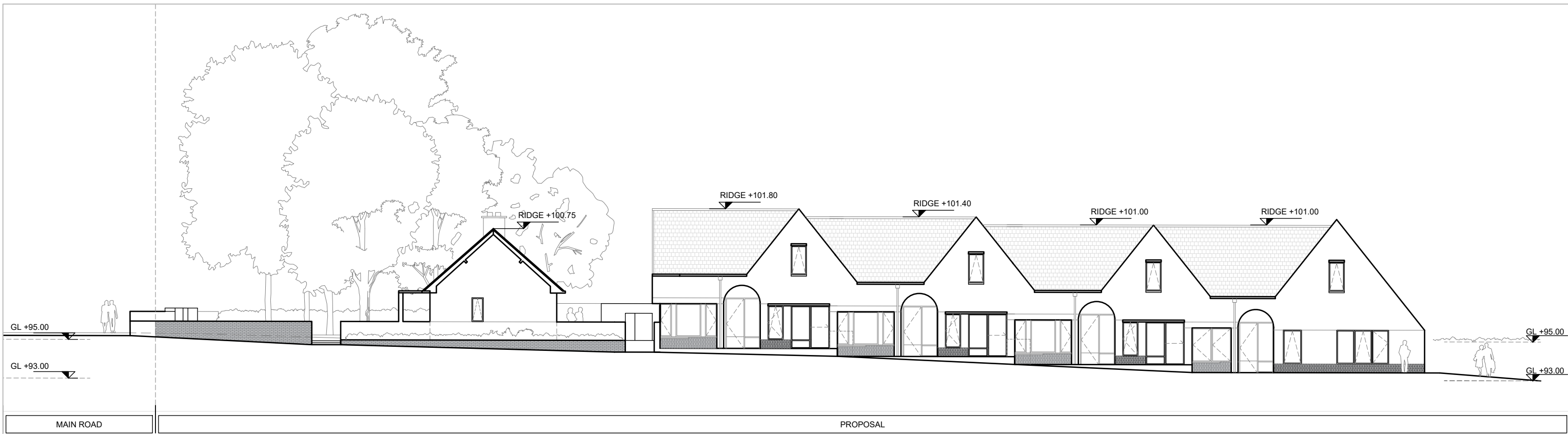
1 CONTIGUOUS SOUTH ELEVATION 1:200@A3